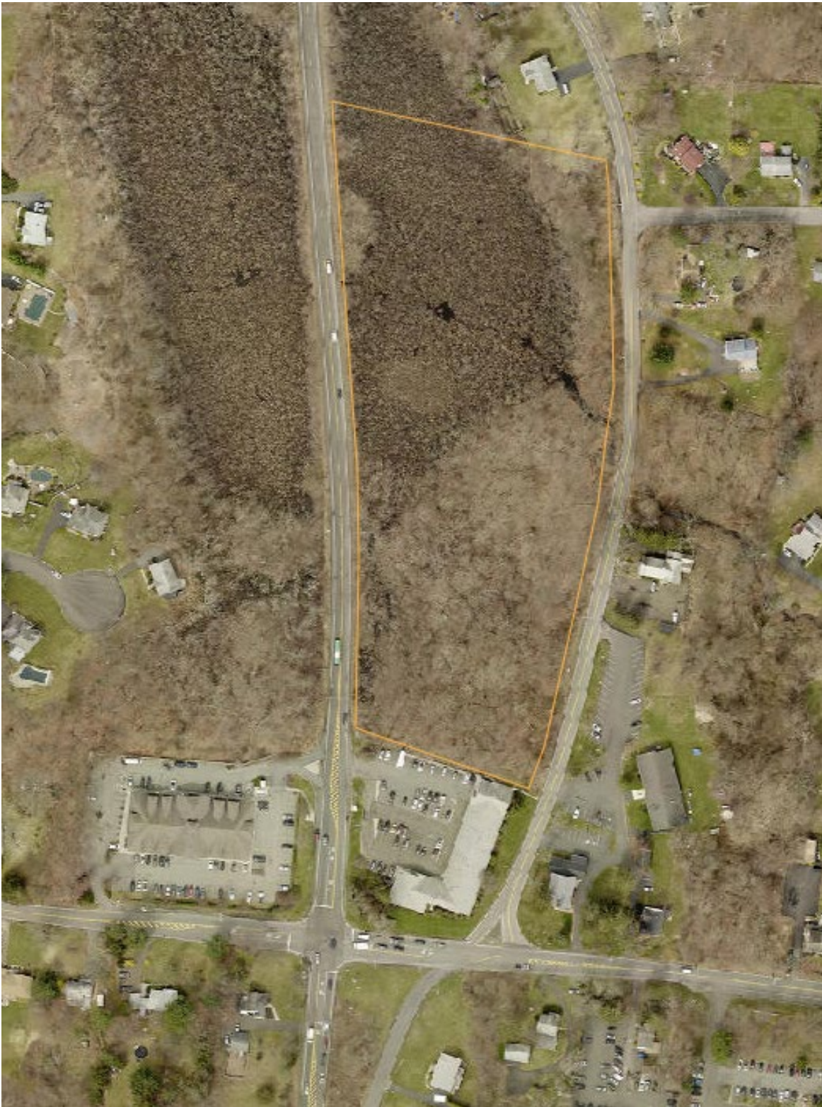
Location of subject lot between NYS 45 on the west side, and Old Schoolhouse Road on the east side. The site would take access from Old Schoolhouse Road, across the street from Village Hall, because of the large state regulated wetland and buffer on the northwest side.