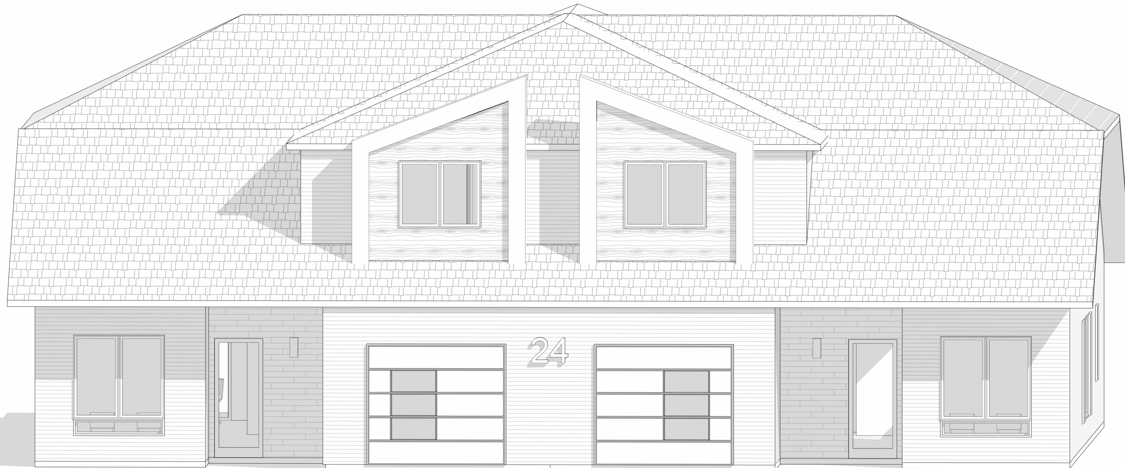
① FRONT 3D VIEW